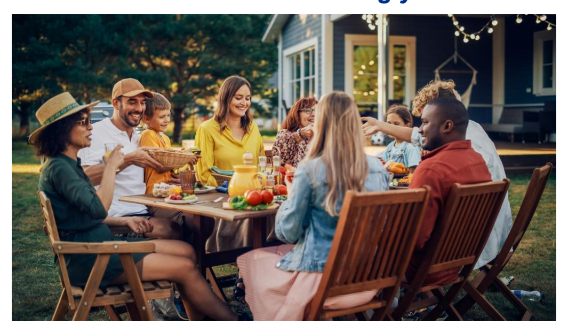
June's Monthly Update