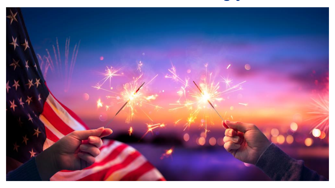
July's Monthly Update